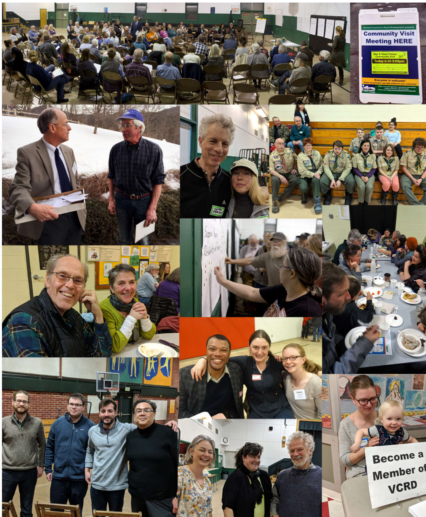
Scenes from the "Our 4-Town Future" Community Visit process.