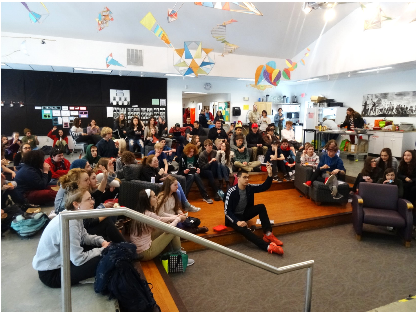
Sharon Academy High School students shared their ideas for the future.