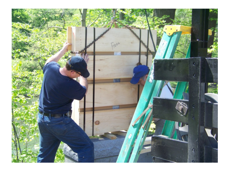
The Granite Memorial Stone arrives